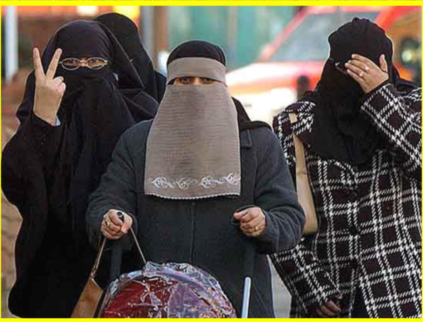
The “DOTING” Parents outside Tweed Court House and a few of his ‘Aussie’ well wishers, exchanging dialogue with the press.